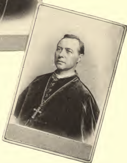
ARCHBISHOP RIORDAN SAN FRANCISCO.